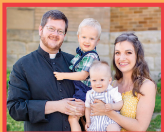
The Alenskis Family