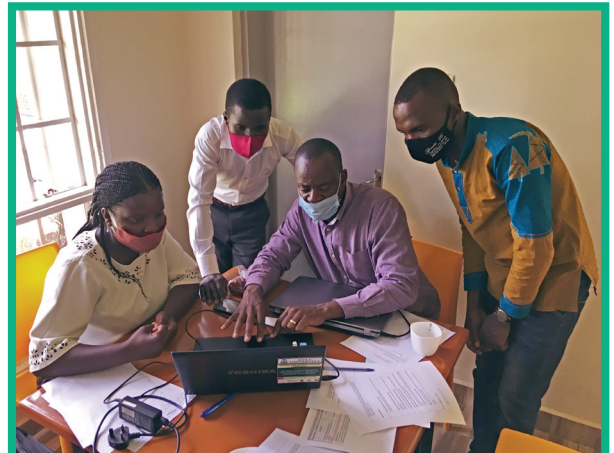
UCU's business incubation center is a hub where students brainstorm and develop entrepreneurial ventures.