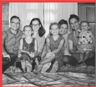
The Whitaker Family