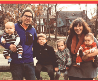
The Twichell Family