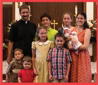
The Hicks Family