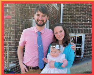
The Weeldreyer Family