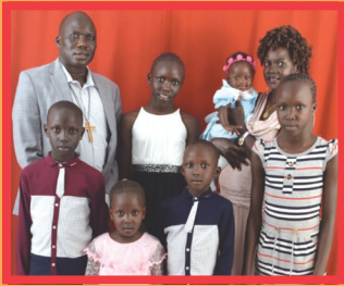
The Nhial Family