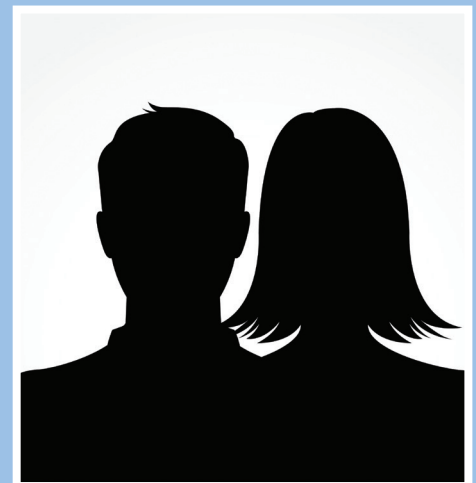
J&K Church Development in North Africa