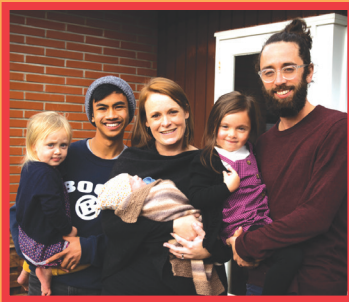
The Benton Family