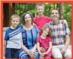
The Hamlin Family