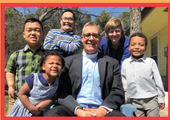
The Gresser Family