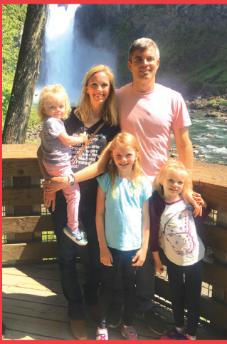
The Blaine Family