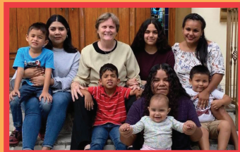
The McCall Family