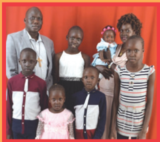
The Nhial Family