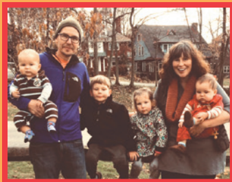
The Twichell Family