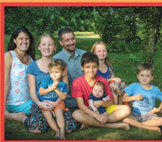
The Hicks Family