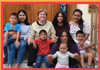
The McCall Family