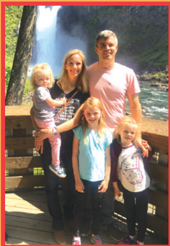
The Blaine Family