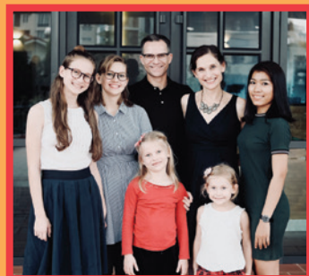
The Whitaker Family