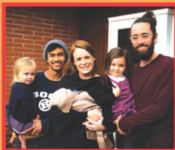
The Benton Family