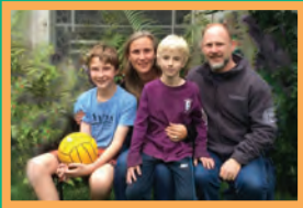
The Hill Family