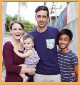
The Benton Family