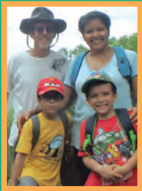
The Pyle Family