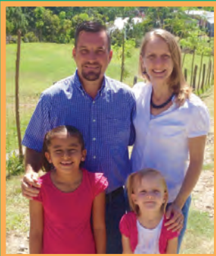
The Miller Family