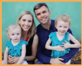
The Blaine Family