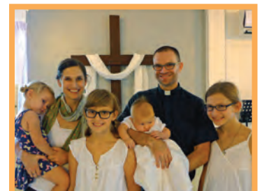
The Whitaker Family