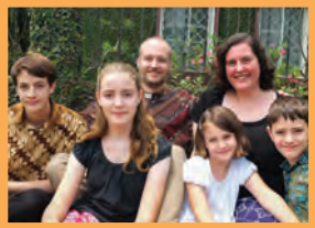
The Colvin Family