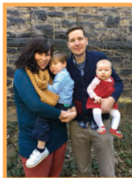
The Twichell Family