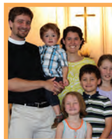
The Hicks Family