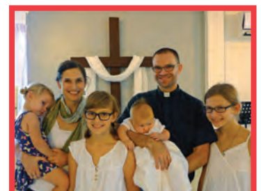
The Whitaker Family