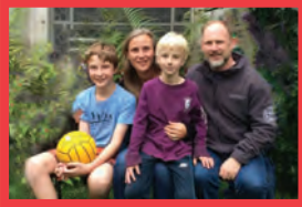
The Hill Family