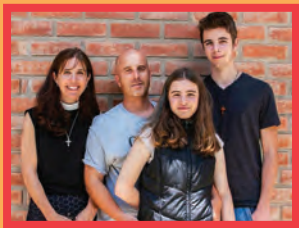
The Firestone Family

Please focus on the following as you pray: