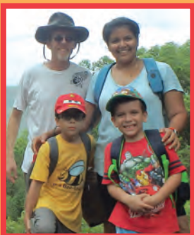
The Pyle Family