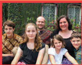
The Colvin Family