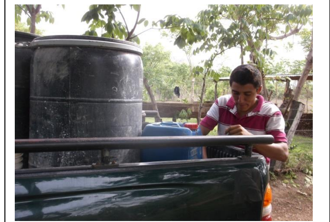
Top: New braces donated to the Regional Hospital of Danli. These are Iowa braces from Club Foot Solutions. Above: Hauling water in San Lorenzo so the in-school feeding program can happen. The barrels fill the pila to wash dishes, the water jugs are for filtered drinking water.