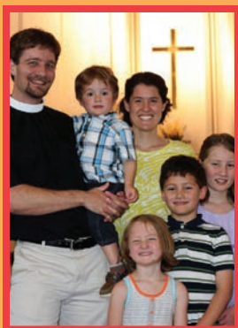
The Hicks Family