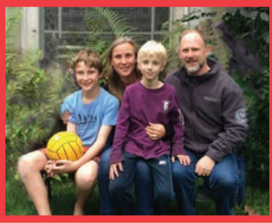
The Hill Family