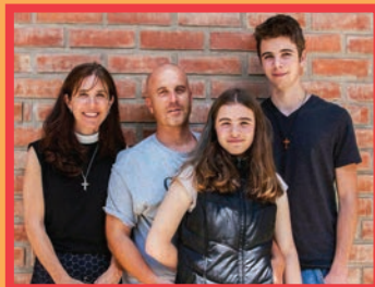
The Firestone Family