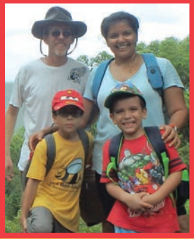
The Pyle Family