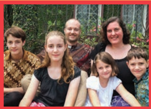
The Colvin Family