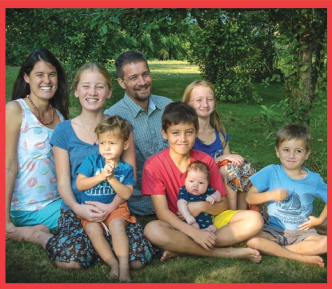
The Hicks Family