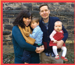
The Twichell Family