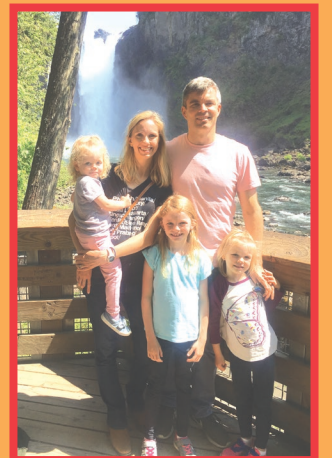
The Blaine Family