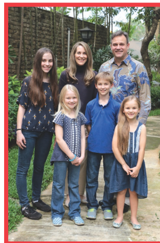
The Long Family