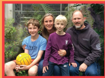
The Hill Family