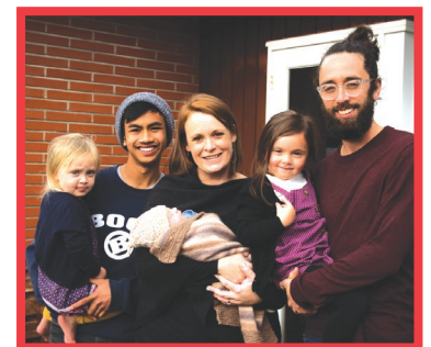
The Benton Family