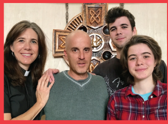
The Firestone Family