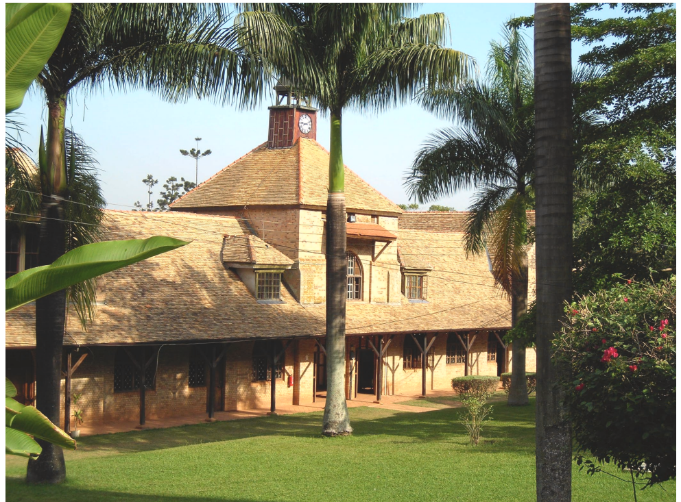
The heart of Uganda Christian University is centered on Jesus Christ and the 100-year-old Bishop Tucker Theological College.