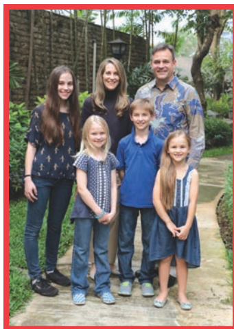
The Long Family