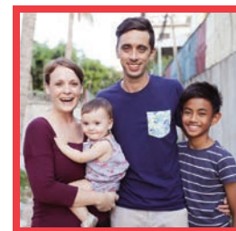
The Benton Family