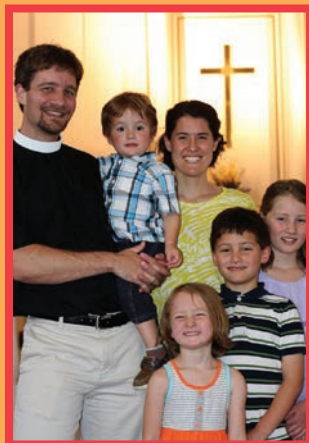
The Hicks Family