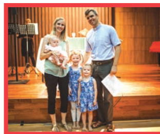
The Blaine Family