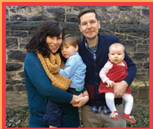
The Twichell Family