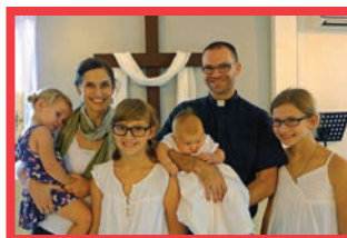
The Whitaker Family