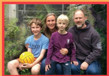
The Hill Family