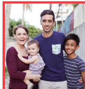
The Benton Family