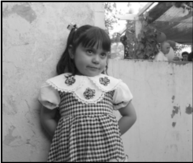
Pray for children's ministries in Chile.